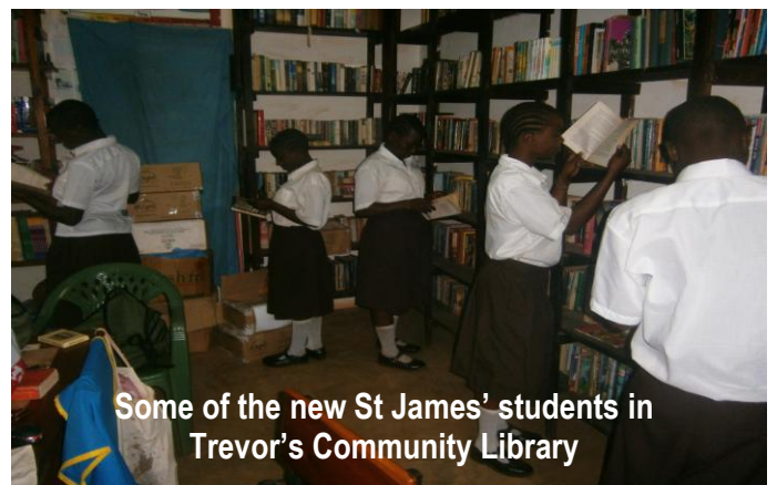
Some of the new St James' students in Trevor's Community Library

Make secure online donations with BT MyDonate